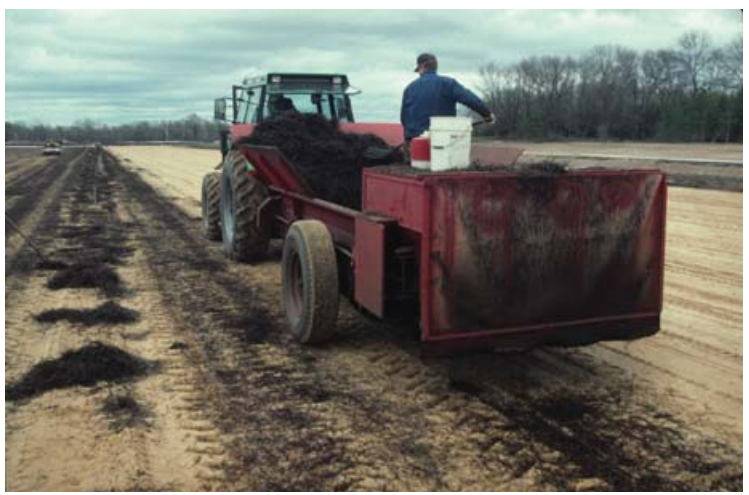
Mechanically spreading vines over a cranberry bed as part of the planting process.

tons of vines per acre. After the vines are spread, they are pushed into the sand with a straight dull disk. The bed surface is then firmed with a cultipacker. The vines are then sprinkle-irrigated two or three times per day for several weeks. Within a few weeks the cuttings produce roots and new vine growth begins. The newest hybrid cultivars are only available as sticks or plugs and are set by hand or with a vegetable planter.