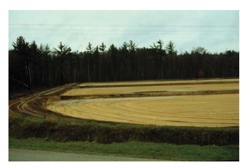
Cranberry beds that have been formed with dikes around the perimeter. Sand has been spread on the surface in preparation for planting vines.

Once a suitable site has been located and all required permits are obtained, site preparation can begin. The overlying topsoil is scraped away and stockpiled for later use. The subsoil is excavated down to about 18 inches above the final water table and rectangular beds are formed that typically measure 150 feet wide by 600 or more feet long. Removing exposed soil reduces later weed and disease problems. The beds are laser-leveled with a slight crown so there are no low spots in which water can collect. Beds are designed so that water flows from an inlet bulkhead to an outlet bulkhead in the opposite end.