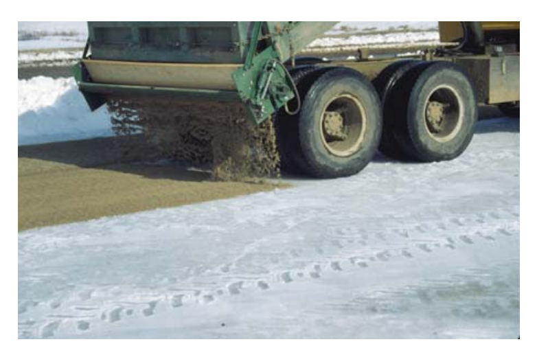
A half-inch layer of sand is being spread over ice on a cranberry bed from a dump truck. Sanding helps to control pests and to rejuvenate a bed.

As the fruit begins to redden in early September, the plant has already begun its preparation for winter dormancy. In December during the first bitter cold weather, the dormant vines are flooded with water that quickly freezes into a solid covering of ice. This ice layer protects the cranberry vines from extreme cold and fluctuating temperatures and prevents winter winds from desiccating the vines.