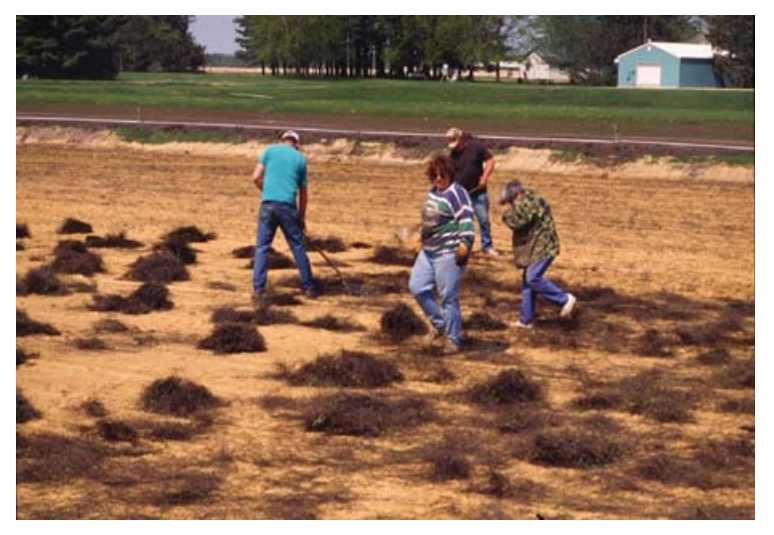
Spreading vines by hand over the sand surface of a cranberry bed.

Once the bed is prepared for planting, cranberry cuttings are spread on the sand at the rate of about two