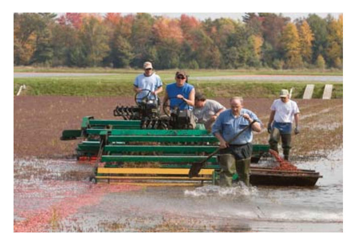
A mechanical cranberry picker in use in a cranberry bed. Fruit to be sold as fresh cranberries is usually harvested this way.

The harvest method for cranberries varies according to how the fruit will be used. Fresh fruit are harvested with a picking machine. Such machines have tines that comb through the vines and catch the fruit that are then lifted onto a conveyor then into a bin. After harvest, fruit for fresh use is dried in boxes with slatted bottoms and stored in heavily insulated or mechanically refrigerated buildings. Later fruit are sorted and packaged for retail sale.