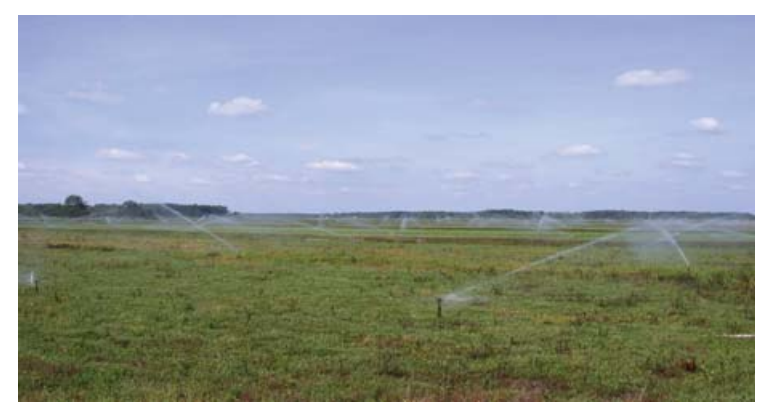
Sprinkler irrigation of a cranberry bed. Cranberry beds are not flooded during the growing season and water is supplied through the sprinkler system.

Although cranberries are wetland plants, they do not grow under water or in standing water. Excellent drainage is essential, as is the method of application. Typically cranberry beds are bordered by drainage ditches to allow water to drain from the beds. Many beds have one or more drainage tile lines running the width of the bed. The water table is manipulated during the growing season to remain 12 to 18 inches below the surface of the bed.