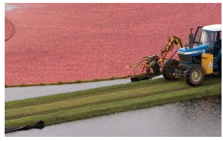
Cranberries are corralled with floating booms then pumped or conveyed out of the bed into waiting trucks.

Fruit that is destined for processing into juice, sauce, or sweetened dried cranberries is wet harvested. For wet harvesting, beds are flooded with eight to ten inches of water. A machine with a circular beater mounted on the front is driven through the bed to remove berries from the vines. Alternatively a "slipper" is drawn through a bed to remove fruit from the vines. The berries float to the water's surface are corralled into a corner, and then conveyed or pumped out of the bed to a waiting truck. Berries for processing are delivered to a receiving station where they are graded, cleaned and frozen for later use.