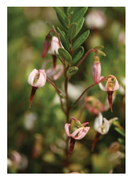
Cranberry flowers resemble the head of the Sandhill crane from which the name cranberry is derived.

Wisconsin cranberries flower in late June and early July. The cranberry flower resembles the head and neck of sandhill cranes and the name 'craneberry' was an early name for the fruit. The blossom period lasts for three to four weeks depending on the weather. Pollen is transferred from flower to flower by wild bees, bumble