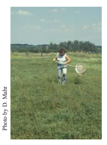
An IPM scout using a sweep net in a cranberry bed to estimate insect populations.

Cranberries encounter many pests, which if not controlled, will reduce yields and fruit quality. Wisconsin cranberry growers follow the principles of Integrated Pest Management (IPM). Using IPM principles, growers monitor pest activity in their marshes and control pests only when the threat of economic damage is imminent.