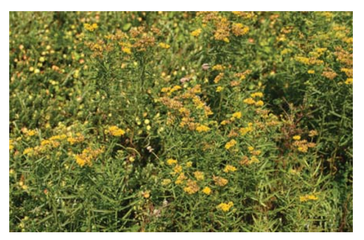
Weeds are a major pest in cranberry beds. They compete with vines for water, light, and nutrients.

using pre-emergent herbicides that prevent weeds from germinating, and the second is using postemergent herbicides to kill weeds once they are growing. Most growers use a combination of both mechanical and chemical weed control measures.