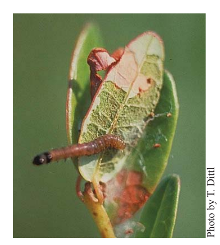
Blackheaded Fireworm is a major insect pest of cranberry vines.

Several insects are major pests of cranberries. Some insects attack the fruit while others harm the vines. In either case, the damage reduces the economic returns of the marsh. The two most significant insect pests of cranberries in Wisconsin are the