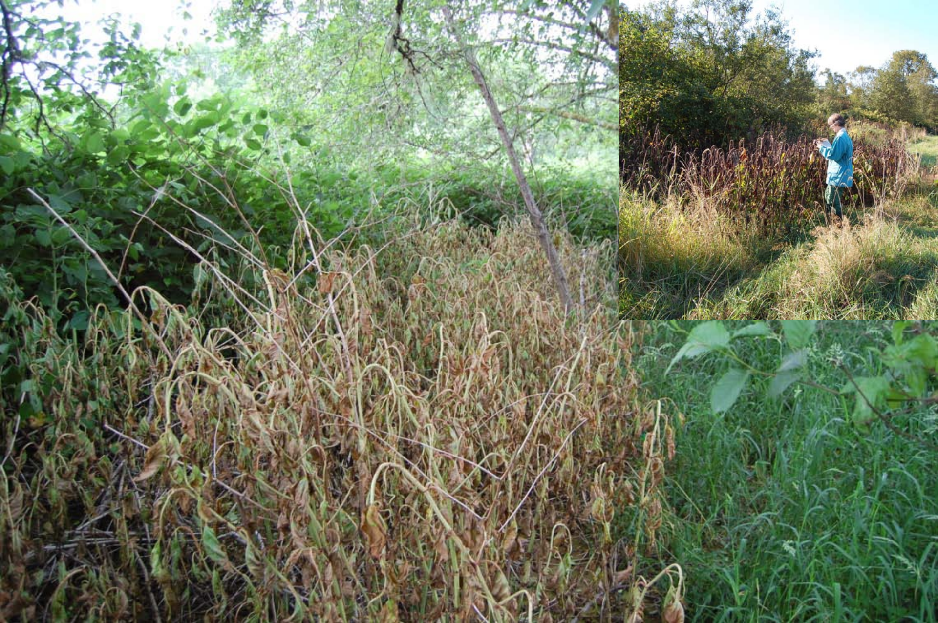
Early Milestone – treated May 2009 (August 2009)